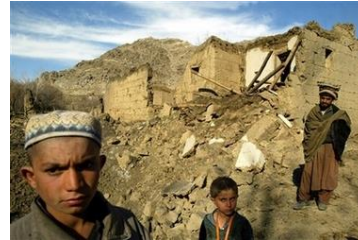
Airstrikes destroyed several in Jabar village, Nijrab District, North of Kabul on 5 February and 5 March 2007.