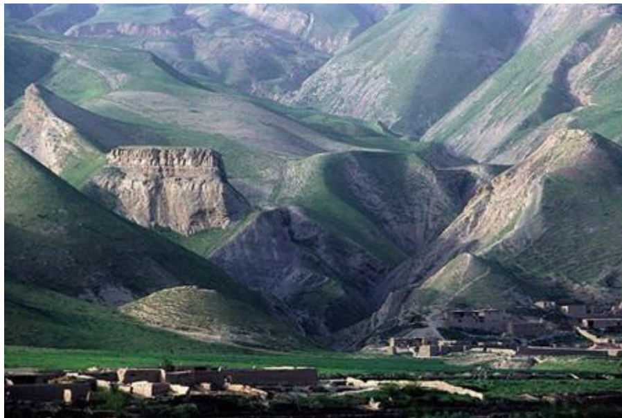
In Samangan Province thousands of acres of land have been illegally grabbed.

ComplexAttack FALSE ReportingUnit - UnitName - TypeOfUnit None Selected MGRS 42SVA7574393351 Latitude 32.477108 Longitude 68.74184418 OriginatorGroup UNKNOWN UpdatedByGroup UNKNOWN Affiliation NEUTRAL DColor GREEN Classification SECRET 67