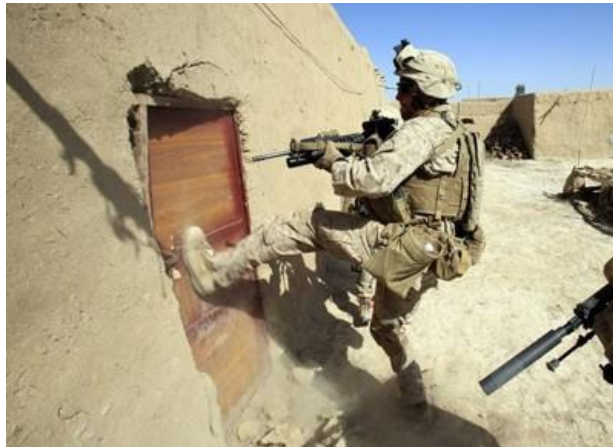
A U.S. Marine breaks down the door of a house during an operation in the town of Marjah in the Nad Ali District of Helmand Province, 16 February 2010.

A later investigation revealed that the raid was led by U.S. paramilitary operators not under the NATO/ISAF command, or even the American armed forces. Numerous efforts to resolve the issue directly with the U.S. Embassy resulted in empty promises of an investigation and swift action, but resulted in no redress of any kind. 58