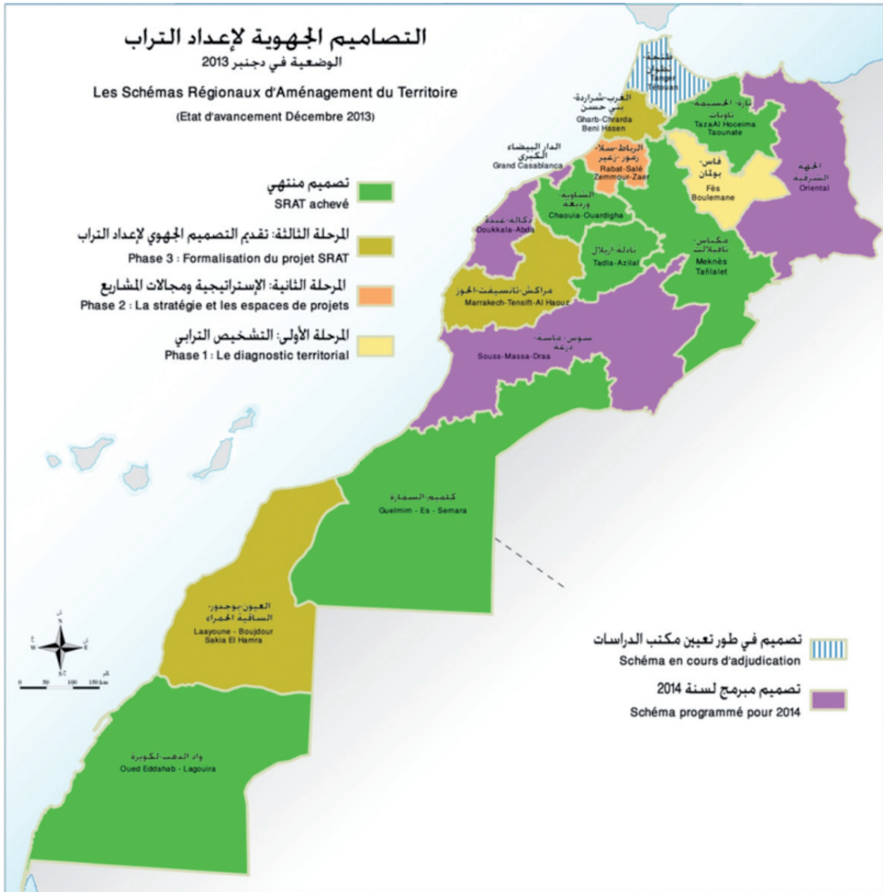
Figure 1 Progress Status of the Regional Territorial Planning Schemes (December 2013)