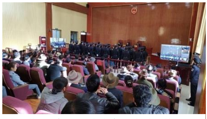
The 24 khagovas (community leaders) on trial at the Rebkong People's Court, 2019.

The historic territory of Tibet consists of 2.5 million km<sup>2</sup> of land corresponding to the geological plateau that China calls the Tibetan-Qinghai Plateau. The high plateau traditionally consisted of three provinces: Ü-Tsang in the west, Amdo in the northeast, and Kham in the southeast.