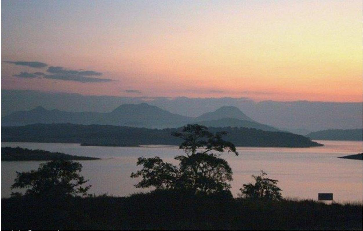
Lake Mutirikwi.