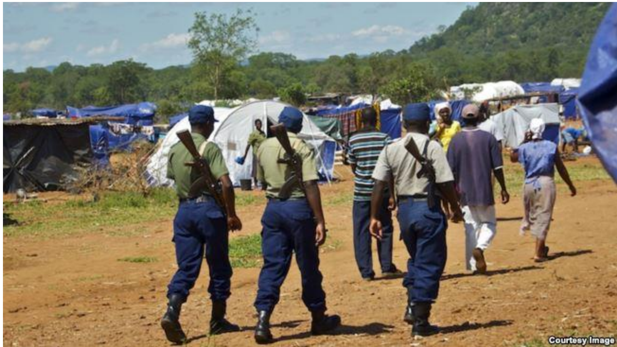
Zimbabwean police on patrol over 20,000 people displaced as a result of the flooded Tokwe-Mukosi Dam at the Chingwizi transit camp before they were forcibly moved to Naunetsi Ranch, Masvingo province.

Displaced farmers have repeatedly charged Zimbabwean police of harassment. 18