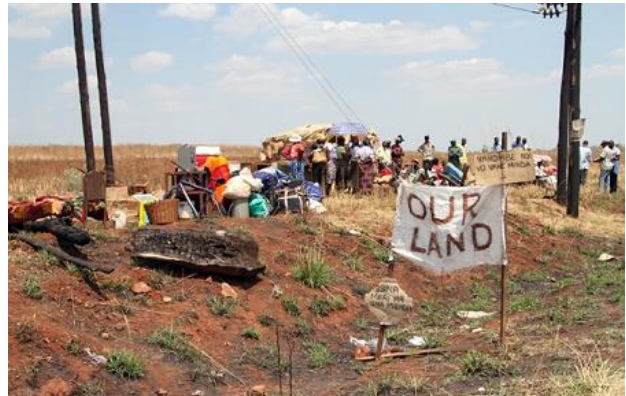
Zimbabwe farmers asserting their claim to farm land.

The demolition of properties is also covered in section 32 of Zimbabwe's Regional, Town and Country Planning Act. That law requires the authorities to issue an enforcement order giving all persons likely to be affected by such demolitions at least one month notice of the intended demolitions. Where a local planning authority seeks to take any administrative action affecting the rights, interests or legitimate expectations of any person that authority must act lawfully, reasonably and in a fair manner.