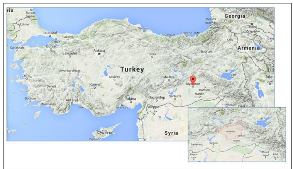
Map of Turkey showing location of City of Diyarbakır with detail indicating the Province of Diyarbakır (pop. 1,528,958).

Mass dispossession, 23,000 people displaced, 27,000 facing forced eviction, 1,100 buildings, including world heritage sites, already demolished