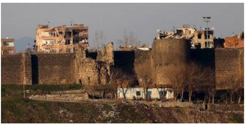
16 January 2016: The historic walls around the Suriçi of Diyarbakır damaged during the security operations and clashes between Turkish security forces and Kurdish militants.

While the centres of cities are redesigned for high-income groups, wealthy, transitory tourists and CEOs, it is not exaggerated to state that 70% of the population living in the redeveloped areas is expected to migrate to the periphery. Concerning the development plans of slums, often the inhabitants are moved from so called "unhealthy, "unsafe" and "filthy" places, turning "development" into a latent forced-eviction mechanism, since the relocated populations, unable to pay the housing in the "redeveloped" areas end up by