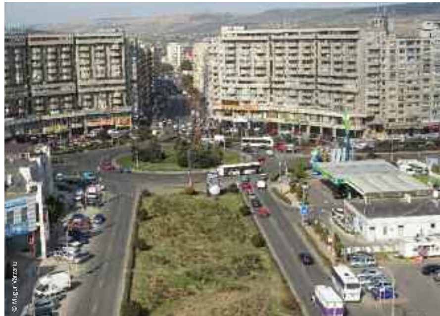
Below: Cluj-Napoca city centre, near the site of the former Coastei Street community.

Pata Rât... They made a square [on the ground] and said, ‘you have this much [land]...’ And they brought... a truck full of boards. They threw them on that piece of land and that was it. I had no one, it was in the middle of the winter... I stayed where I could, here and there.”