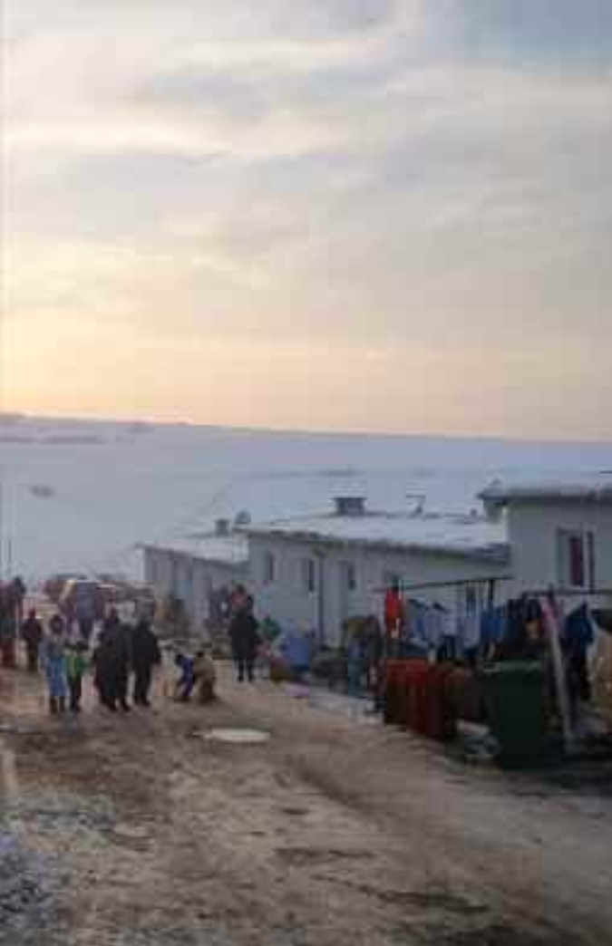
Left: Colina Verde lies at the top of a hill overlooking a landfill and a former chemical waste dump. Below: Children in Colina Verde getting ready for school in September 2011.