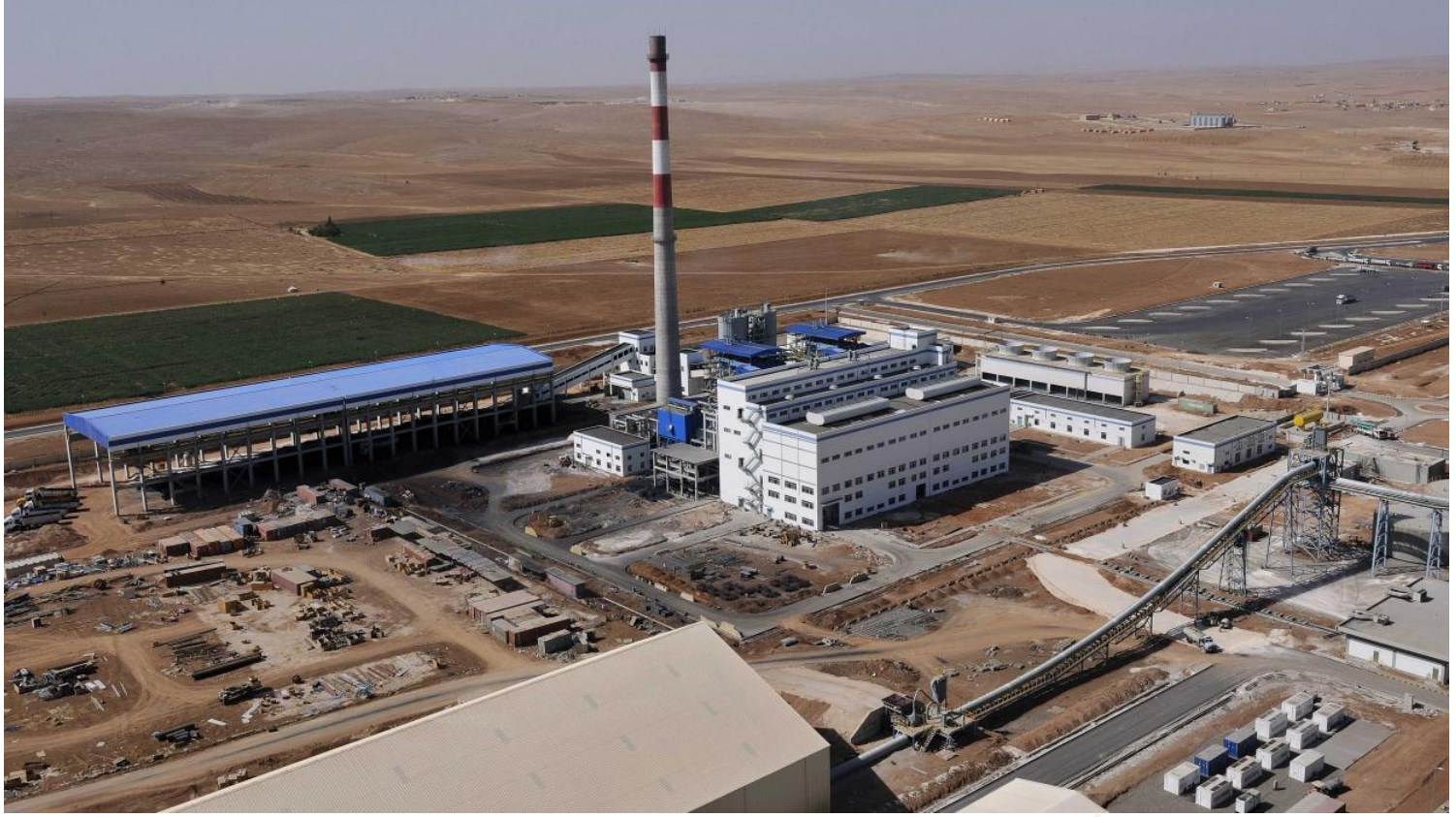
Photo: Lafarge's cement plant in Jalabiya, northeast Syria, 2010.