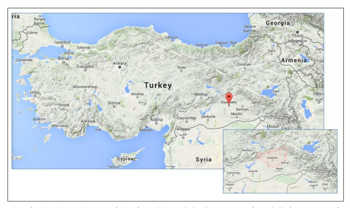
Map of Turkey showing location of City of Diyarbakir with detail on Province of Diyarbakir (pop. 1,654,196).

Since the cease-fire between the Government of Turkey and the outlawed Kurdish Workers Party (PKK) ended in July 2015, armed conflict has displaced at least 355,000 people (February 2016) and curfews have affected some 1,642,000 residents in at least 22 districts of seven cities across Turkey's southeast.